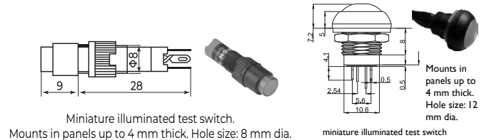
Illustration 2. LED Indicator & Test Switch