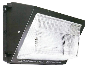
Fits Grandlite® SM106