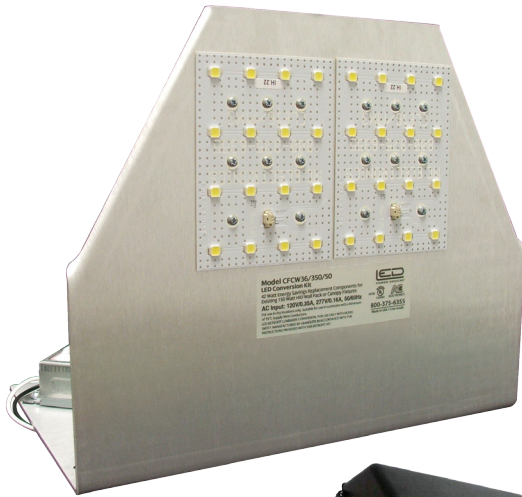
Fits Grandlite® SM311