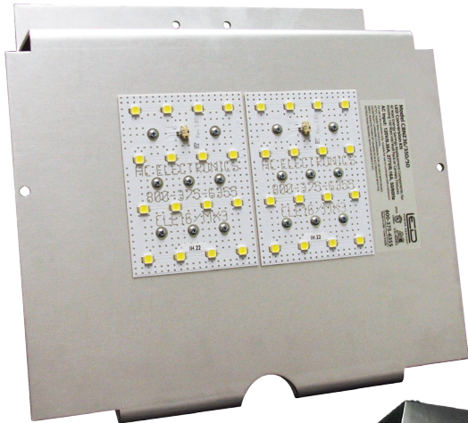
Fits Grandlite® SM012